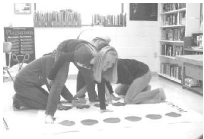
PBIS Reward Day

Students at the High school are reminded throughout the day of the PBIS Panther traits. These banners are hung in the LMC window and are seen from the cafeteria and the hallway as students move through their day. Students are expected to be Respectful , Responsible , Honorable , and Engaged in all areas and activities. We would like to offer a special thank you to Monica Poppy for sharing her sewing talents and time with the construction of the banners.