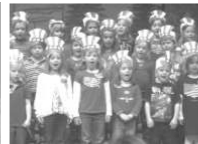
VETERAN'S DAY PROGRAM, NOVEMBER 11